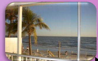
Trip to Summer Condo

Thank you for your time in learning a little about our family. Whatever you decide, may God bless you, your child, and your loved ones. We are very excited about having another baby in our family to love, nurture, and grow with. A child is a precious gift that comes with a lifelong commitment that we hold dear to our hearts.